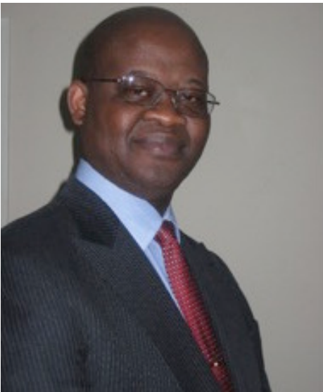
Okezie I Aruoma (USA)

Talk Title: Nutrition, Genomics and Human Health: A Complex mechanism for Wellness